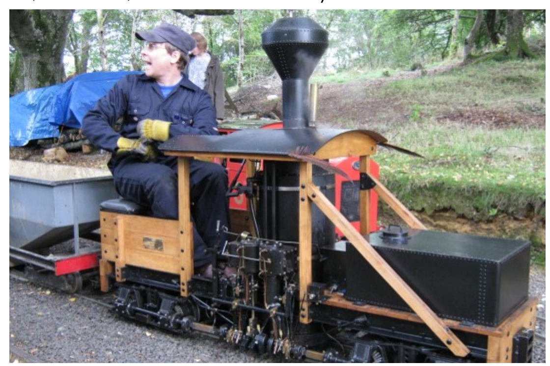
A Shay Steam Locomotive

We encourage ideas for the name-branding of our railroad. If you have any ideas please pass them along. We are encouraging volunteers to help with the construction and operation of the railroad, so please contact me if you are willing to be part of this great project. I will be more than happy to train and educate anyone who wants to participate as a train engineer, conductor, stationmaster, or on the maintenance-of-way crew.